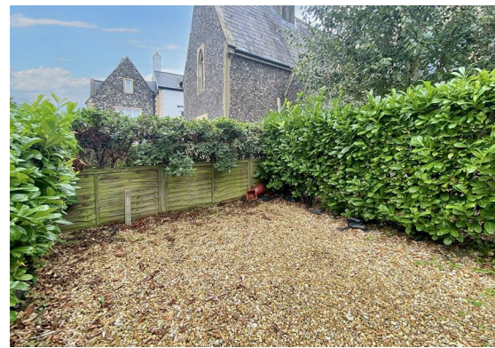
Bathroom 8'2 x 5'1 (2.49m x 1.55m) Portion of Garden